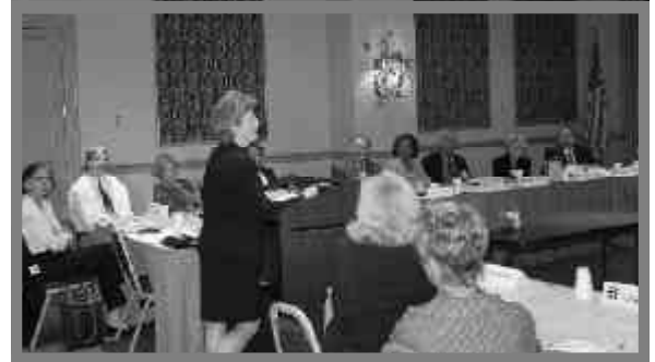
Secretary Hood addresses members of Florida's arts and historical councils