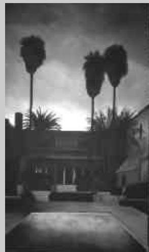
Sheila Cotton, "Not Quite Night," oil on canvas, 36" x 60"