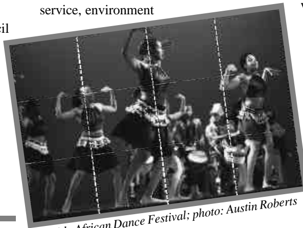
Florida African Dance Festival

Radisson Hotel Miami, 1601 Biscayne Boulevard. This 3-day institute is a national resource for training in arts and non-profit management. It is an ideal professional development opportunity for Florida's arts management staff, artists, cultural and civic leaders, volunteers, parks and recreation program staff, educators, and managers of community arts, education, health, social service, environment